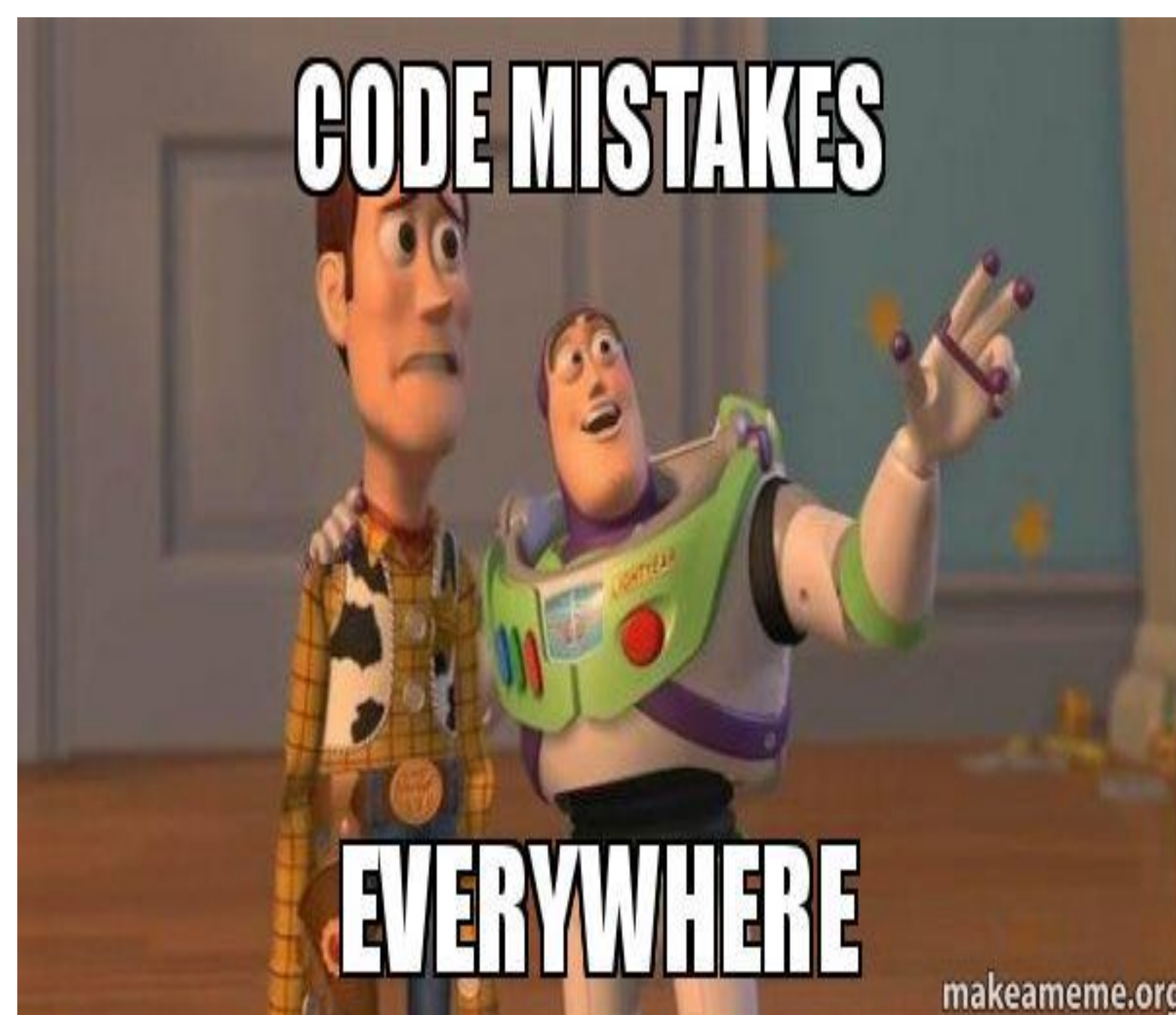
Rare picture of me and Aymeric working on the project

Ideally, LCLS will be completely independent in terms of the entire proposal review process; everything we do will be internal. We are also aiming for a clean, user-friendly interface. No one should struggle to navigate through our database. We have high hopes for the outcome.