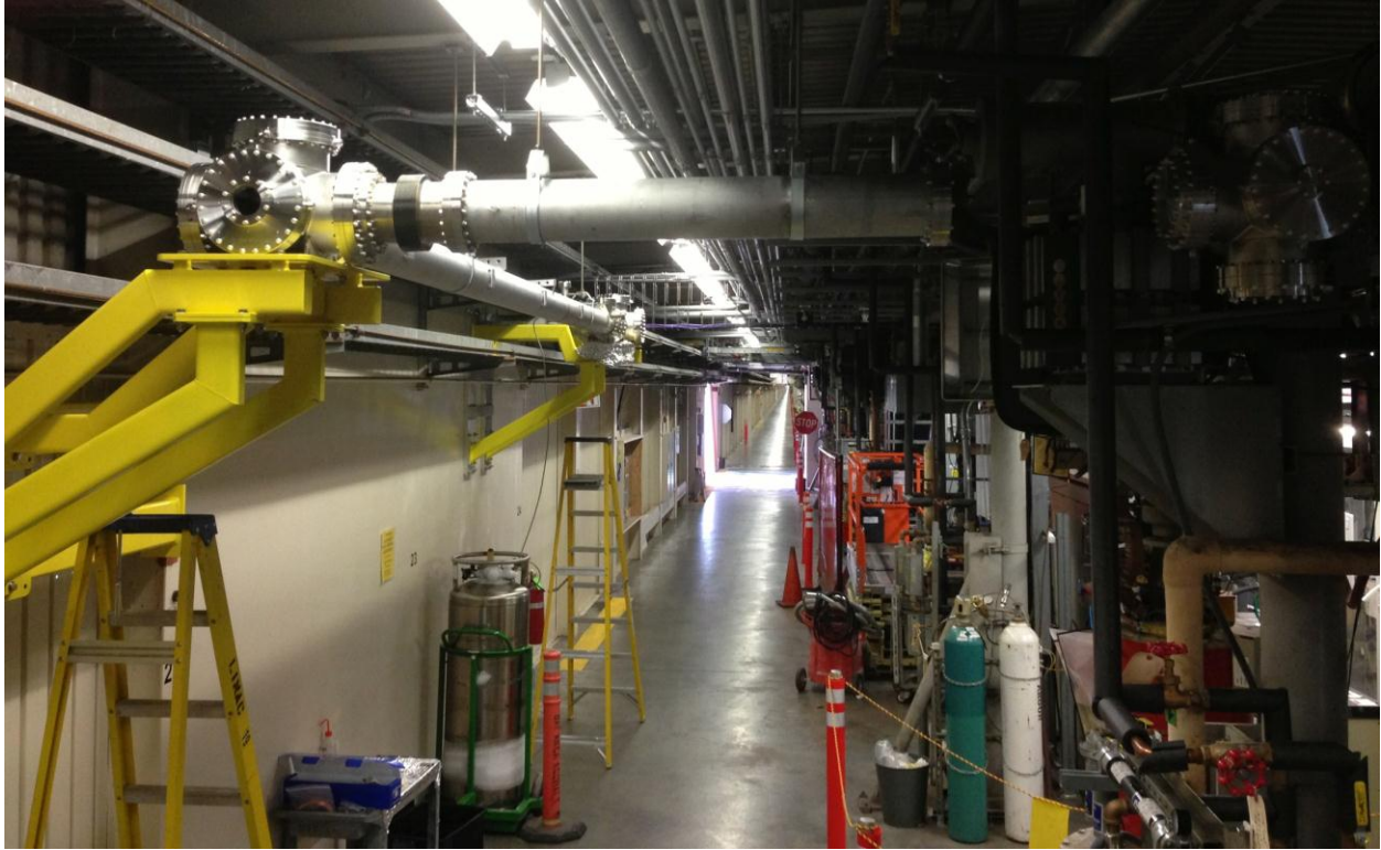
Figure 2: Laser transport line in Klystron Gallery.

Work is also ongoing in the new FACET Laser Room to prepare the tables and infrastructure for the lasers. Power and water is due to be complete on the 27 th to coincide with an LCLS PAMM.