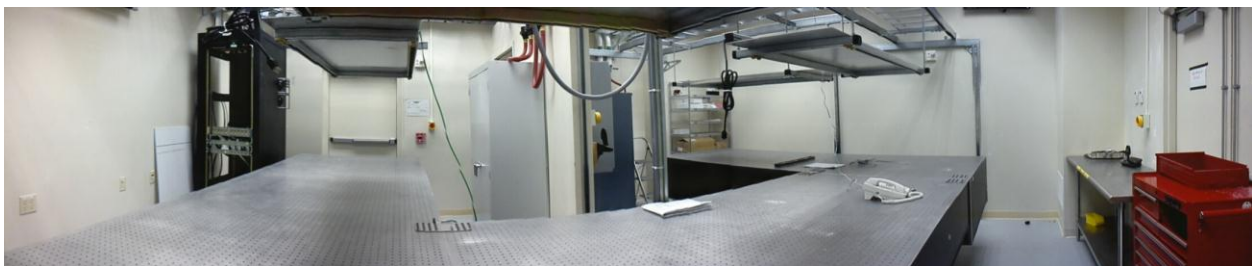
Figure 3: FACET Laser Room with three optical benches for FACET and also LCLS laser work (One Lab!).

Work is also ongoing in the new FACET Laser Room to prepare the tables and infrastructure for the lasers. Power and water is due to be complete on the 27 th to coincide with an LCLS PAMM.