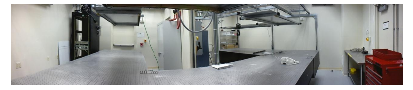
Figure 3: FACET Laser Room with three optical benches for FACET and also LCLS laser work (One Lab!).

Work is also ongoing in the new FACET Laser Room to prepare the tables and infrastructure for the lasers. Power and water is due to be complete on the 27<sup>th</sup> to coincide with an LCLS PAMM.